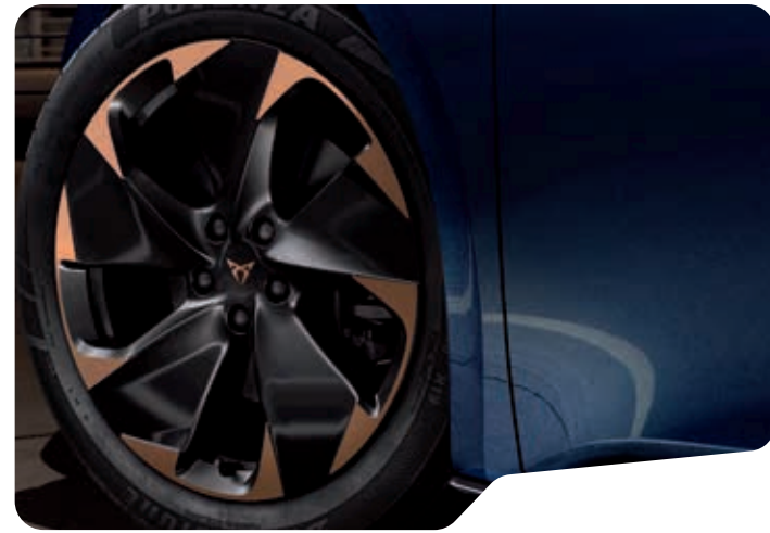
→ 19" COPPER TYPHOON S