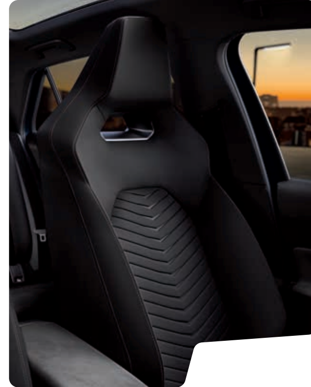
← SEAQUAL® BUCKET SEATS S