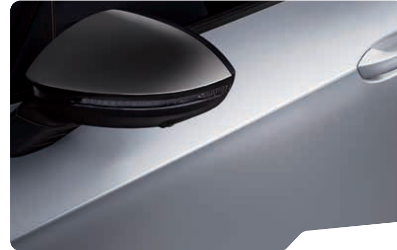
← GLACIAL WHITE 2