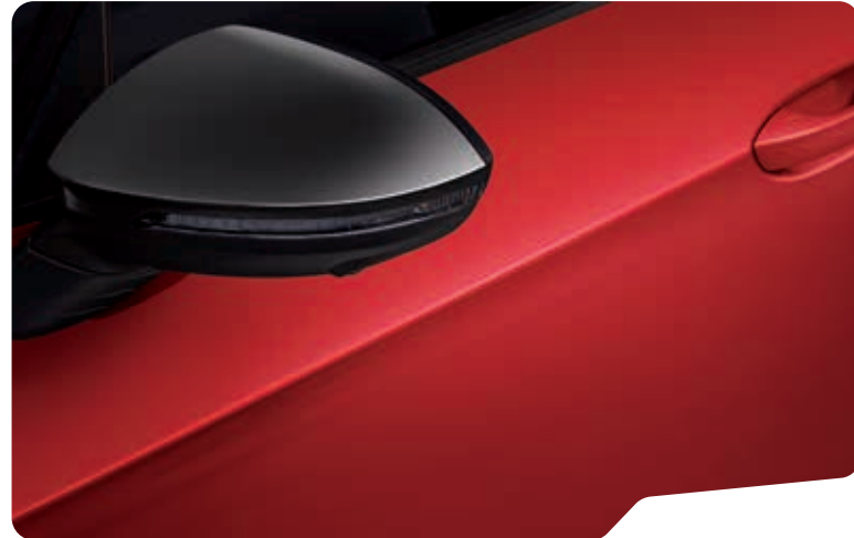
← RAYLEIGH RED 2