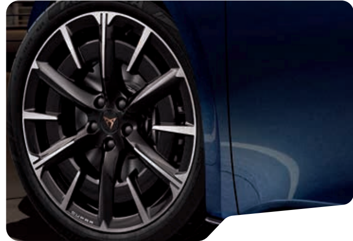
← 20" FIRESTORM O