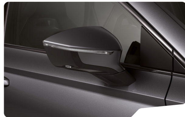
↓ GRAPHITE GREY M S