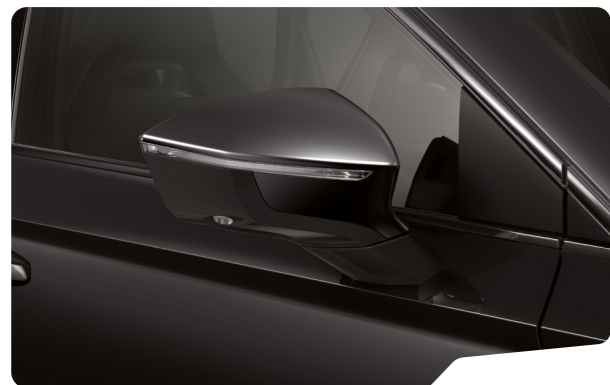
↓ MAGIC BLACK M S