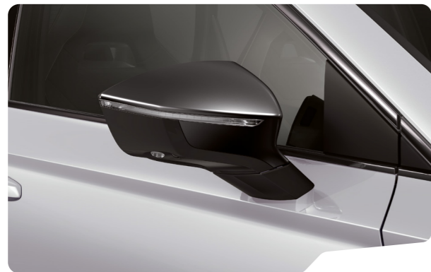
↓ NEVADA WHITE M S